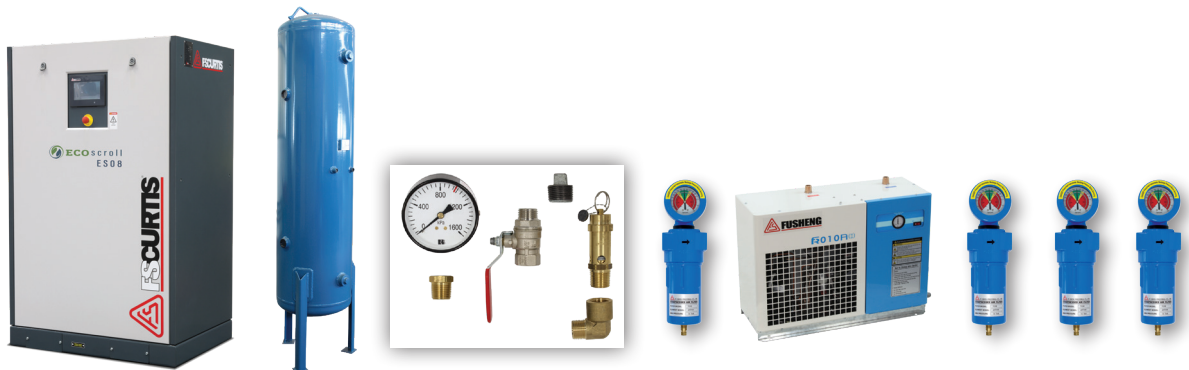
FS-Curtis ES08 Oil-Free Ultimate Package shown

Ideal for applications where the highest standard of compressed air quality is critical such as dental and medical, food and beverage, and chemical and pharmaceutical facilities. Each package comprises an ultra-quiet running FS-Curtis oil-free scroll compressor, vertical air receiver, refrigerant dryer and four stages of filtration.