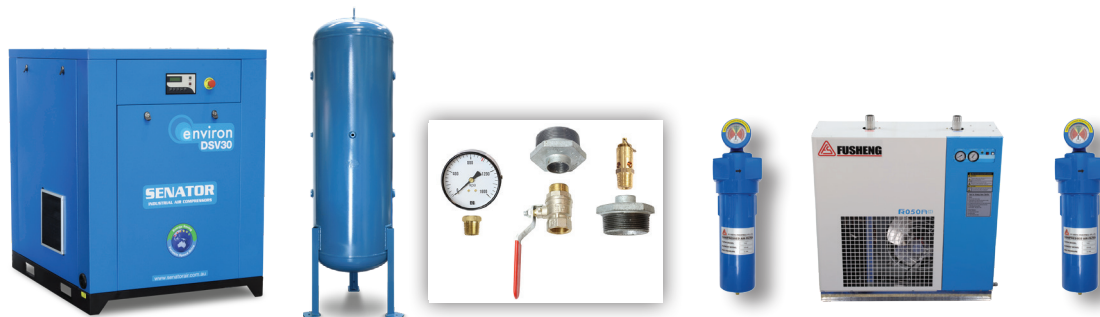
Senator DSV30-8 Professional Package shown