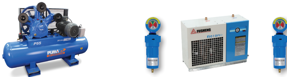
Puma P55 Professional Package shown

A popular choice for industrial applications with compressed air demand of up to 1.52 m³/min. Each package features a Puma reciprocating compressor, refrigerant dryer and two stages of filtration. The clean, dry compressed air is suitable for powering pneumatic tools and machinery and also for spray painting.