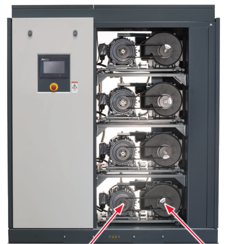
ES15 (access panels and guards removed)

This design concept offers lower cost and higher reliability due to mass production of the standardized motor and air-end module.