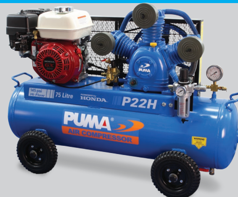
P22H Manual Start