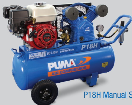
P18H Manual Start