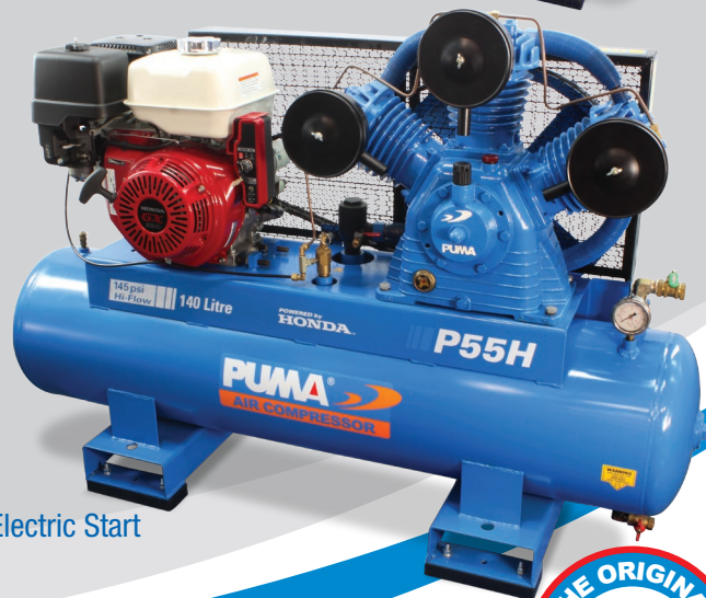
P55H Electric Start