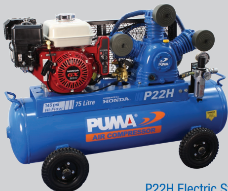
P22H Electric Start