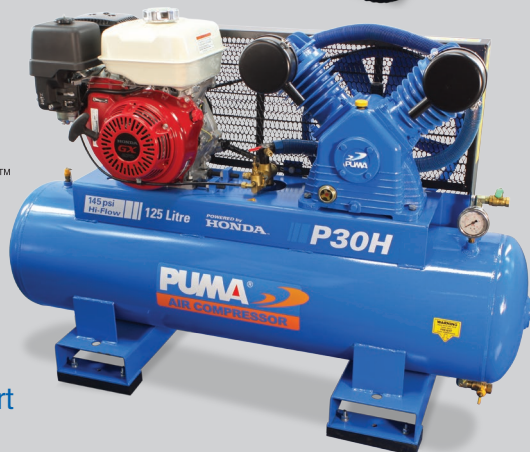
P30H Manual Start