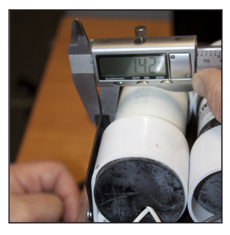
The capacitor box is now made from thicker steel for added strength.