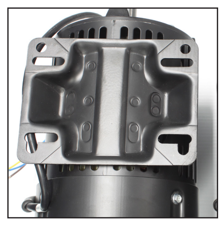
25% more spot welds are being used to attach the new foot mount.

Glenco Air & Power Pty Ltd | ABN 21101370085 | 21 Resource Street, Parkinson QLD 4115 | Australia tel 07 3386 9999 | fax 07 3386 9988 | email sales@glencomfg.com.au | www.glencoairpower.com.au